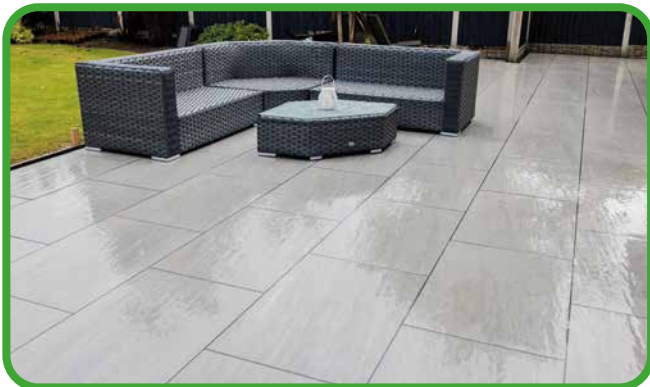
Porcelain Patio pointed with GftK vdw 815plus, the 2-part, epoxy paving joint system

https://nccstreetscape.co.uk/type-of-paving-unit/porcelain-paving-faqs.html