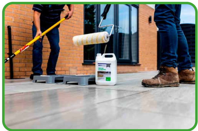
Pre-sealing porcelain tile paving with NCC Porcelain Tile Protector before grouting with GftK vdw 815plus

Note: The joint ends should not be closed with an extruded (gun applied) silicone or polyurethane joint sealant, or similar, as these contain plasticisers and/ or oils that can migrate into the paving and stain or discolour the edges, which is then almost impossible to remove without replacing the slabs!